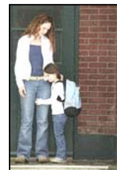
Services offered to children (7-13 years of age) and their mothers.